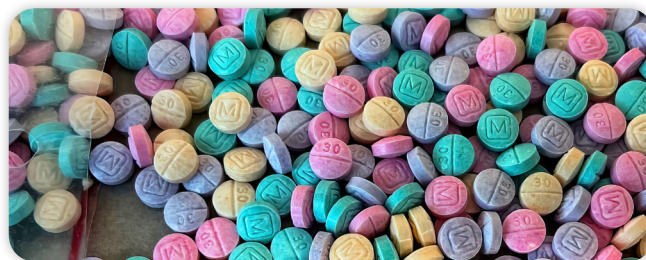
*FAKE rainbow oxycodone M30 tablets containing fentanyl